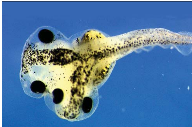
Figure 2. Xenopus embryo with two heads after experimental stimulation of the head inducer Dickkopf1.